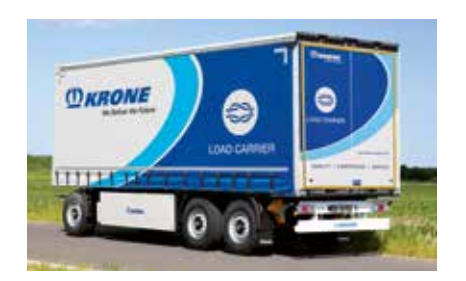
3-axle drawbar trailer. In sliding curtain design.