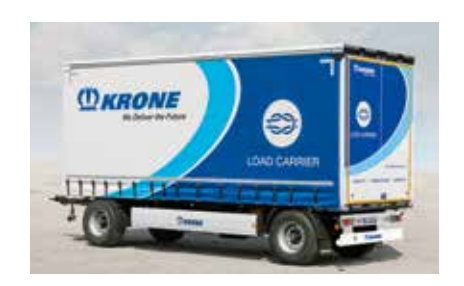
2-axle drawbar trailer. In sliding curtain design.

Tail lifts from different manufacturers, in upright or foldable design, are available.